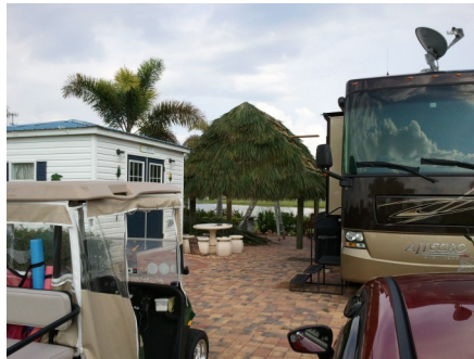
Bob and Sues Chickee !

Watch your thoughts; they become words. Watch your words; they become actions. Watch your actions; they become habits. Watch your habits; they become character. Watch your character; it becomes your destiny